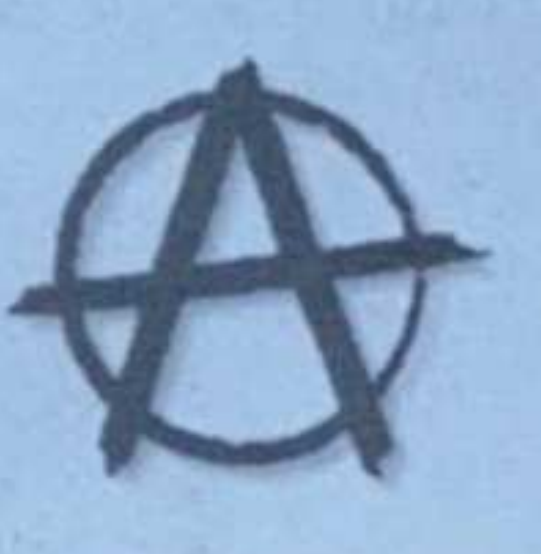
(U) Anarchist Flag