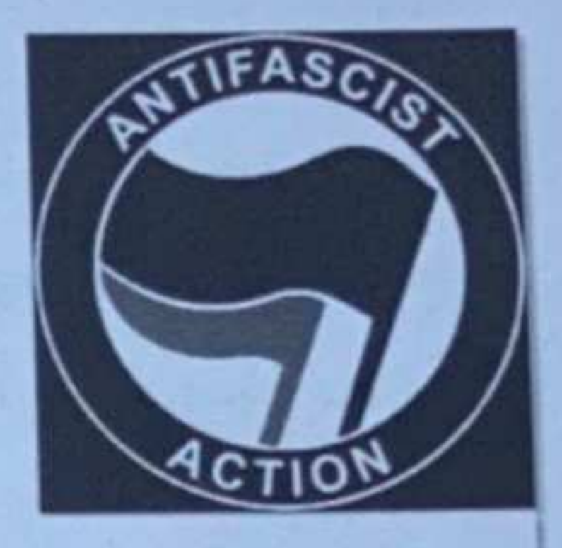
(U) ANTIFA United States

participated in widespread domestic unrest in the United States, provoking riots, looting, arson, and violent attacks against law enforcement and right wing protesters. 10,11,12